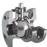
SPLIT BODY FLOATING