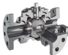
3&4 WAY FLOATING & TRUNNION